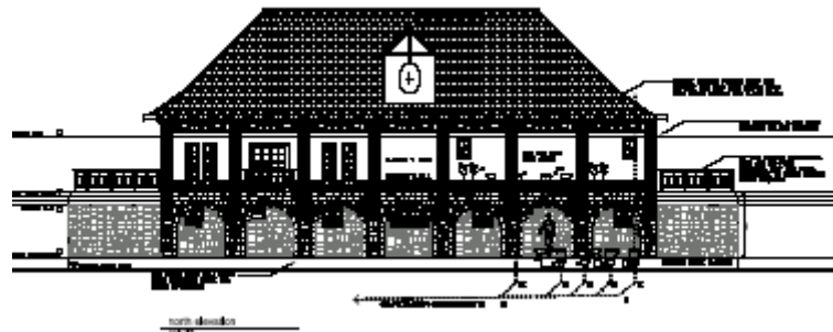
EAST ELEVATION – FACING SCIENCE BLOCK