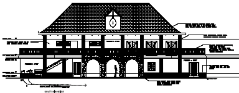
WEST ELEVATION – FACING MITCHELL FIELD

Detailed drawings are posted on the Headmaster's Notice Board in the Pelican Quad.