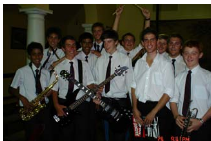
Members of the Wind Band and Jazz Band

The Matric Final Recital will be held on 11 th September at 18h30 in the Clarke Auditorium