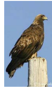
Golden Eagle Aquila Chrysaetos