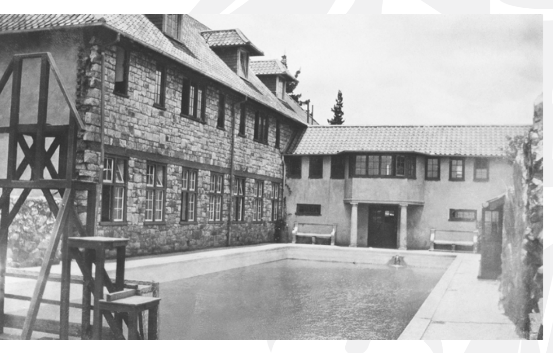
In 1916, our first swimming pool was built, known as the Gladstone Bath (named after Lord Gladstone, Governor-General of the Union of South Africa and generous donor to the swimming pool fund).

St John's provides a holistic, world-class education that includes the opportunity to participate in sport at all levels. We are committed to partnering with communities in meaningful ways that allow us to share our excellent facilities and expertise whilst nurturing potential and discovering talent.