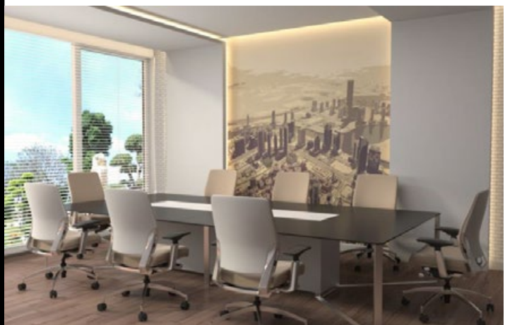
Commercial Interior design services