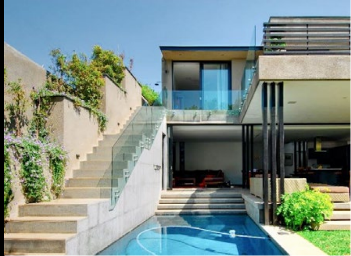
Architectural residential services