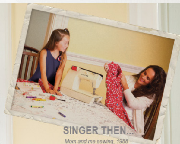
SINGER THEN... Mom and me sewing, 1988

sewing machine! With it's sleek, compact design and weighing less than 7kg, it's perfect for sewing in smaller spaces as well as taking with you to classes.