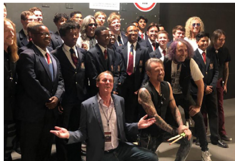
Our College Choir accompanying Foreigner on stage on their recent tour.