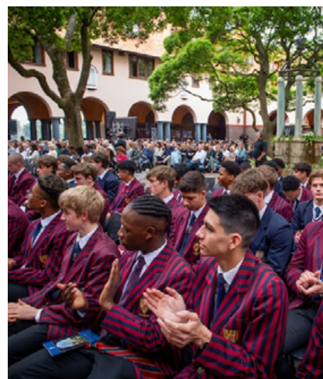
Class of 2023