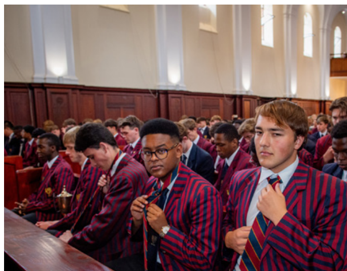
Class of 2023