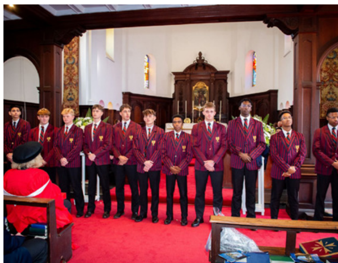
School leadership 2024