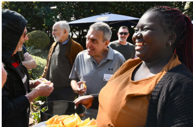
Half-time orange segments – a fond memory of winter rugby and hockey matches

Returning from the tour we were greeted at the OJ Club with platters of "half-time orange segments" – the perfect appetiser to the lunch that followed.