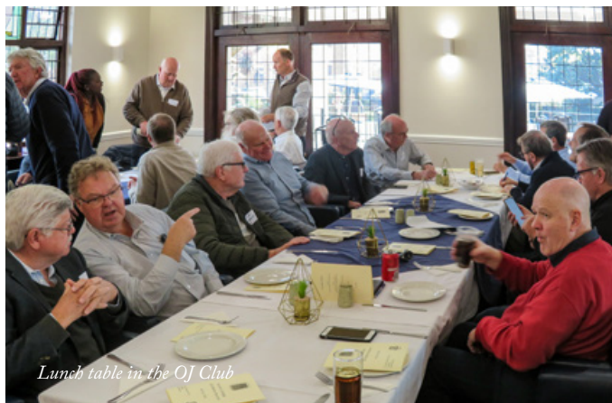
Lunch table in the OJ Club

Lunch was an enjoyable sit-down meal in comfortable chairs with the entire dining area of the Club at our disposal. Places changed at regular intervals so that we could all meet and get to know each other again. Of course, there just wasn't enough time to really catch up on 50 years of our lives.