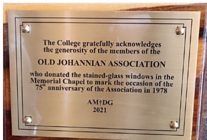
The plaque outside The Memorial Chapel commemorating 75 years of the Old Johannian Association.