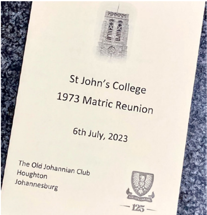
The menu and proceedings programme

A wonderful day together wound up quite late and hopefully the club bar profits were boosted accordingly. All agreed that it had been hugely worthwhile and that we would make an effort to stay in touch in future.