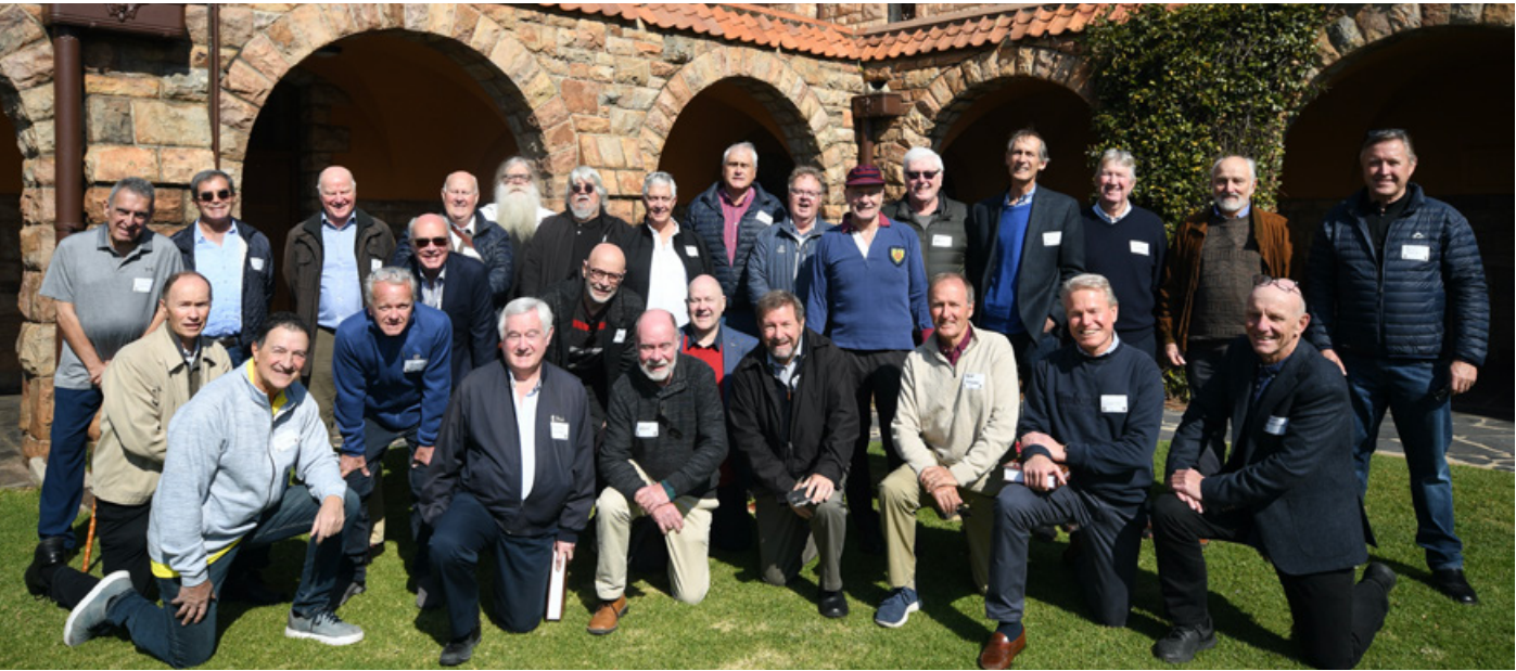
The 27 who were at the 50th Reunion lunch:

A wonderful day together wound up quite late and hopefully the club bar profits were boosted accordingly. All agreed that it had been hugely worthwhile and that we would make an effort to stay in touch in future.