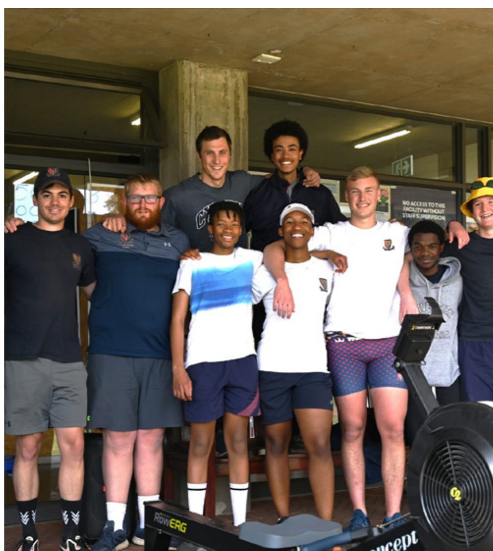
St John’s Rowing Community supports the 24-hour Ergothon